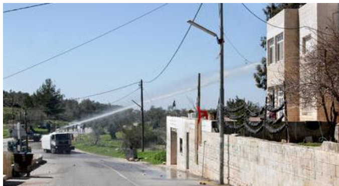
Israeli army spray residential area in Nabi Saleh with "skunk" water, March 2013.